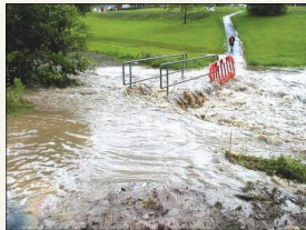
FLOOD WATER POURS THROUGH BIDDULPH VALLEY PARK ON WEDNESDAY 5TH JULY.

Whilst all over the country homes and businesses have suffered from the torrential rain of the past few weeks, Park Middle did not escape the effects