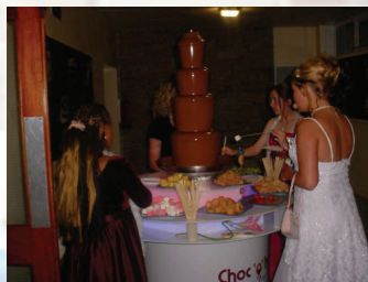
ENJOYING THE CHOCOLATE FOUNTAIN...