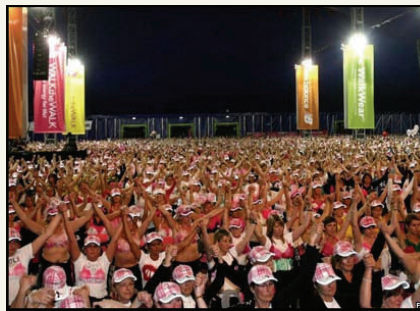
OVER 10,000 PEOPLE TOOK PART IN THE MOONWALK, THERE'S A PRIZE IF YOU CAN SPOT OUR 3 BLISTER-FOOTED PARTICIPANTS AMONGST THIS LOT OF UNDRRESSED WALKERS!