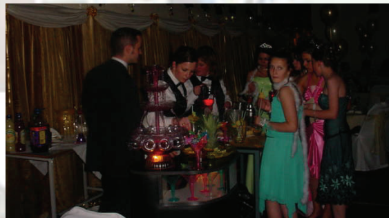
MINE'S A CRANBERRY ON THE ROCKS PLEASE BAR TENDER ....