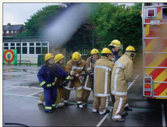
SOME YEAR 8S LEARN ABOUT THE WORK OF THE FIRE BRIGADE

HERE AT PARK WE ARE USED TO A PRETTY TIGHT TIME-TABLE AND EVERYONE KNOWS WHERE THEY SHOULD BE, WHAT THEY SHOULD BE DOING THERE AND WHEN THEY SHOULD