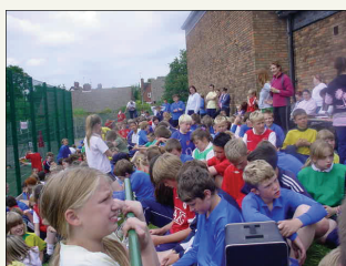
AND FUN WAS HAD BY ALL.

Tug-of-War. Mercury showed themselves to be the strongest team in the first round.