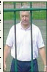
BEING LET OUT FOR GOOD BEHAVIOUR