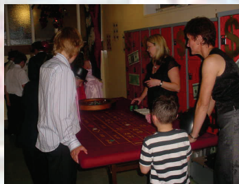
HAVING A LITTLE FLUTTER...

After many months of preparations that saw numerous cake sales; sponsored unicycle rides and beetroot-juice cocktail fountains in the staff room, the Year 8s finally had their chance to shine. They strutted their stuff in their finest togs at the Leavers' Prom on 13th July. A fine farewell.