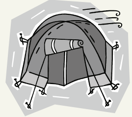
CANVAS AND RAIN—IT'S NOT THE BEST MIX!

All involved would recommend this trip to next year's Year 8s.