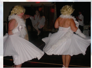
GIVE US A TWIRL!